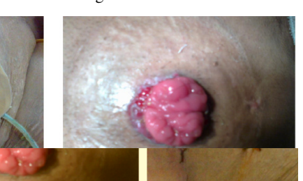
Figure 3b: Colostomy flange Figure 4: After removal of the bridge with bridge