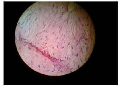
Figure 2: photo micrograph (original magnification x 40; h-e stain)

3. GIST was excluded by immunohistochemistry with negative CD34 and CD117. Beta catenin not done.