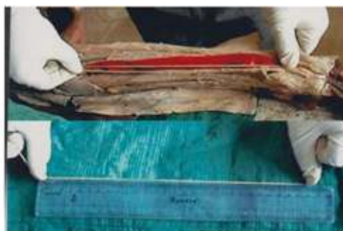
Figure 2: Showing the measurement of length of radial artery from its origin to first dorsal interosseous space