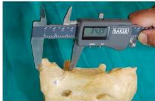
Figure 5: Length of Ala of sacrum