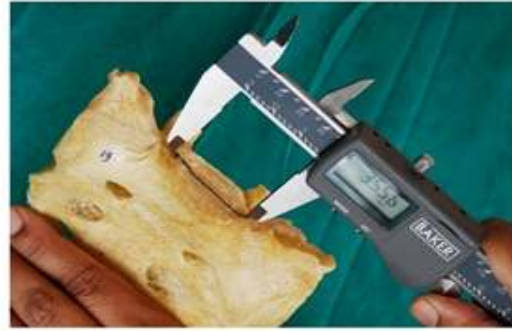
Figure 4: Transverse Diameter of body S1 vertebra