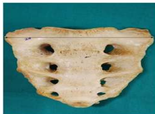
Figure 2: Maximum width of sacrum