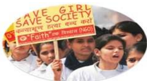
Figure 4: Save girl child and save the future generations

The table-2 correlates the feticide crimes and CSR 2011. The feticide crimes and CSR 2011 was negatively correlated ( P < 0.05 ). That means the feticide crimes 2005 to 2010 decreased but the CSR 2011 increased. The feticide crimes determined 22.0% ( r^2 = 0.22 ) of 2011 CSR.