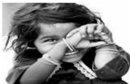
Figure 1: Missing

pre-natal diagnostic techniques shall be conducted except for the purposes of detection of any of the following abnormalities, namely: (i) chromosomal abnormalities (ii) genetic metabolic diseases (iii) haemoglobinopathies (iv) sex-linked genetic diseases (v) congenital anomalies (vi) Any other abnormalities or diseases as may be specified by the Central Supervisory Board. The Act was brought into operation from 1st January, 1996, in order to check female feticide. The Act prohibits determination and disclosure of the sex of fetus and advertisements. The person who contravenes the provisions of this Act is punishable with imprisonment and fine. According to the directions of Hon'ble Supreme Court of India ordered slow implementations with amendments. These amendments have come into operation with effect from 14th February, 2003 4 .