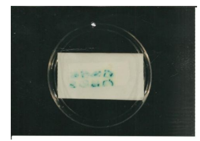
Appearance of blue colony confirms protein-protein interaction(yeast two hybrid system).

After 24h the appearance of blue colour is observed confirming protein-protein interaction.