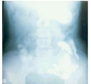
Figure 4: BMFT: Caecum and appendix on left side

BARIUM MEAL FOLLOW THROUGH showed Stomach, Duodenum, Appendix and Caecum on right side suggestive of situs inversus viscerum.