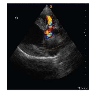
Figure 2: 2 D ECHO and COLOR DOPPLER: perimembranous ventricular septal defect with reversal of shunt

2-D ECHO and Color Doppler showed viscera-atrial situs inversus with dextrocardia, inversely related and dilated great arteries with pulmonary hypertension, dilated RA and RV cavities, large perimembranous ventricular septal defect with inlet extension with reversal of shunt, left sided normal aortic arch and normal biventricular functions.